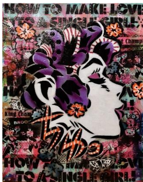
AIKO, Kiss , 2017. 46 x 34 inches, Mixed media on canvas.

Highlights include Basquiat's Valentine (1984), on loan from the personal collection of Paige Powell, alongside works by other seminal artists such as The Bomb (1983) by CRASH and Untitled (1983), a spray painting by Keith Haring spanning three metres. Portraits such as Keith Haring (Red) (2010) and Basquiat (Red) (2010) by Shepard Fairey demonstrate how early practitioners of the genre continue to inspire younger artists, while FUTURA's work El Diablo (1985) - part of KAWS' personal collection - exemplifies the intergenerational dialogue and influence between street artists working today. JR's work Eye Contact #13 (2018) evokes old school rail yards as model trains on tiny tracks move back and forth, creating an optical illusion on each run. Examining how the movement shaped other genres, the exhibition will also display works such as Charlie Ahearn's film Juanito , which captures the story of his twin, sculptor John Ahearn making casts of people in Bronx and immortalising them in plaster. Elsewhere, works by AIKO and Lady Pink will explore how female artists responded and contributed to a genre traditionally dominated by men.