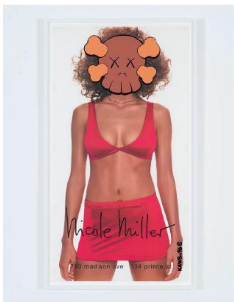
KAWS, UNTITLED (NICOLE MILLER) , 1996. Acrylic on existing advertising poster, 50.25 x 26 inches, Framed: 53 x 29 x 1 13/16 inches. Courtesy of the artist. © KAWS, photo: Farzad Owrang.

City As Studio traces the global history of graffiti and street art from its emergence in the subway yards and parking lots of 1970s New York to its rise as a worldwide phenomenon. It begins with the movement's pivotal innovators such as Fab 5 Freddy , FUTURA and Jean-Michel Basquiat who were part of the dialogue and the Downtown art scene of the late 1970s and early 1980s, and goes on to highlight artists such as Barry McGee , Mister Cartoon and OSGEMEOS , and the groundbreaking styles they created in San Francisco, East Los Angeles and São Paulo. The exhibition also documents the emergence and evolution of artists such as KAWS and AIKO who represent a younger generation of New York street artists.