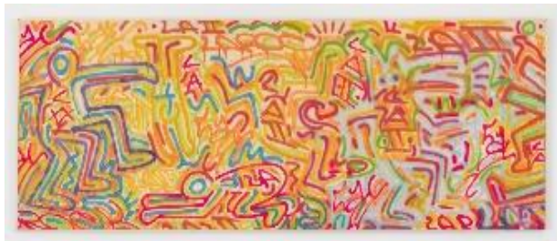
Keith Haring / LA II, Untitled , 1983. Spray paint in wood, 45.3 x 124.0 inches. LA II ARTWORK © LA II / KEITH HARING ARTWORK © KEITH HARING FOUNDATION.